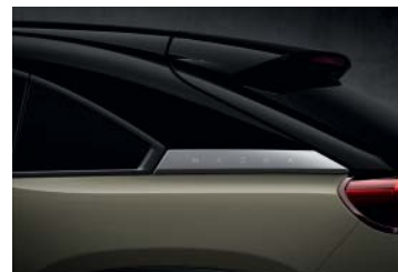
Zircon Sand (Multi-tone)

Browse the link for a full Mazda MX-30 digital car configurator https://www.mazda.ie/configurator/