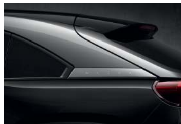
Jet Black-Silver (Multi-tone)