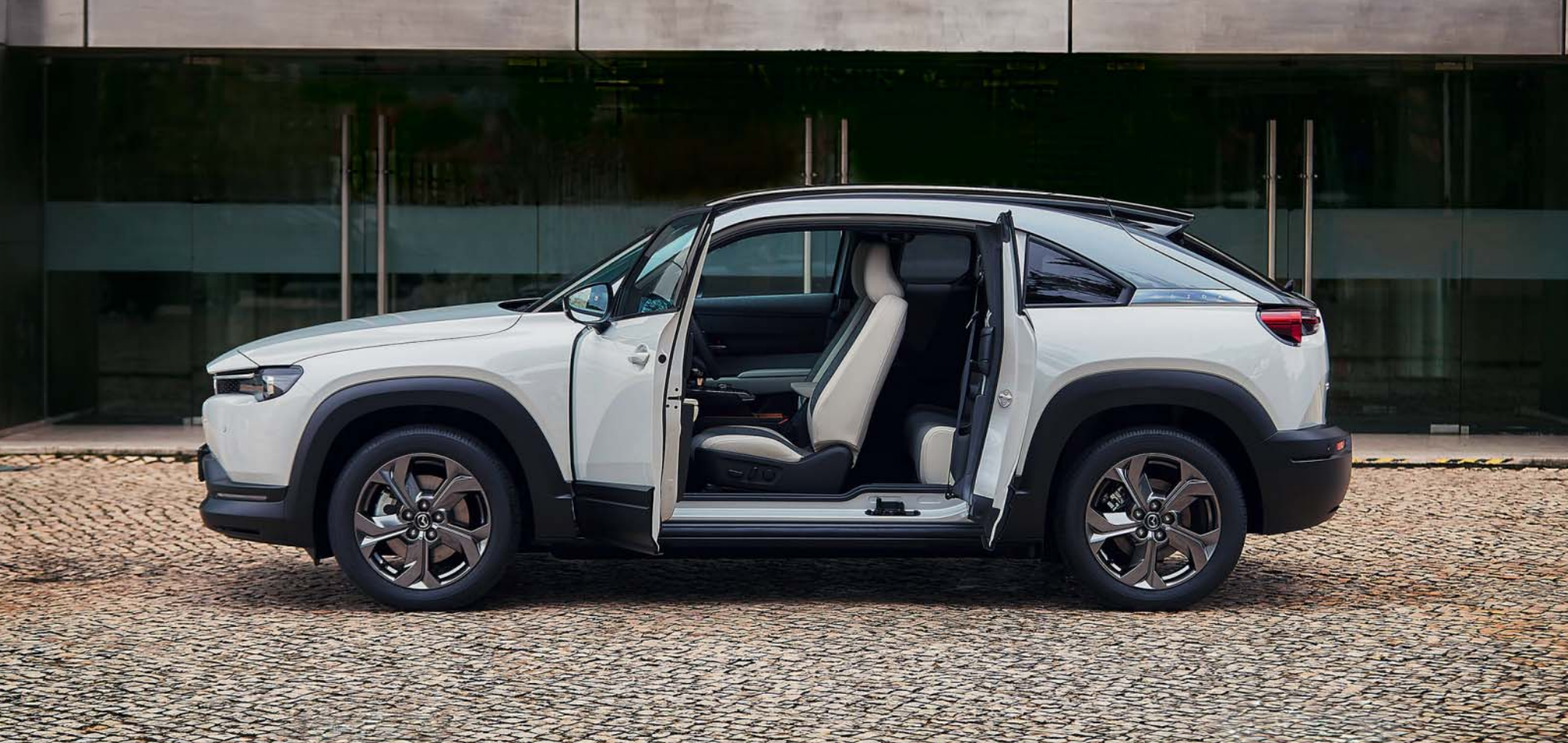
This image is showing the Mazda MX-30 in Ceramic White 3-tone