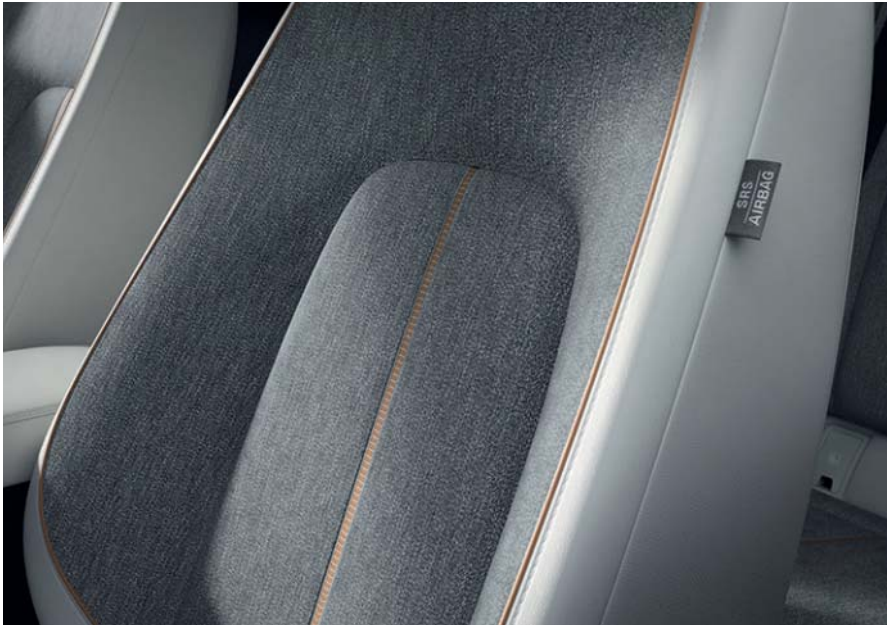
MAKOTO / Modern Confidence