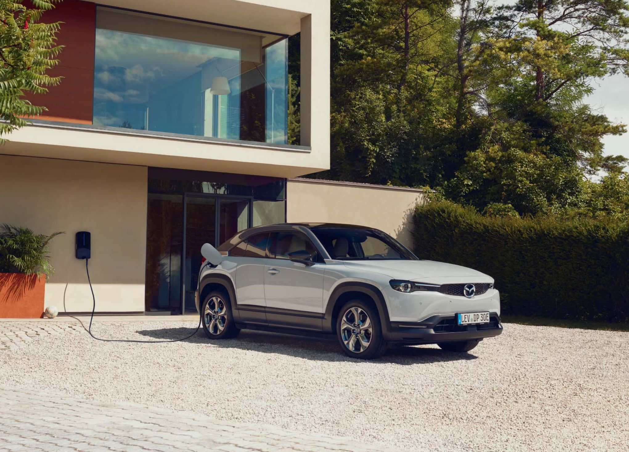
This image is showing a Mazda MX-30 in Ceramic White 3-tone