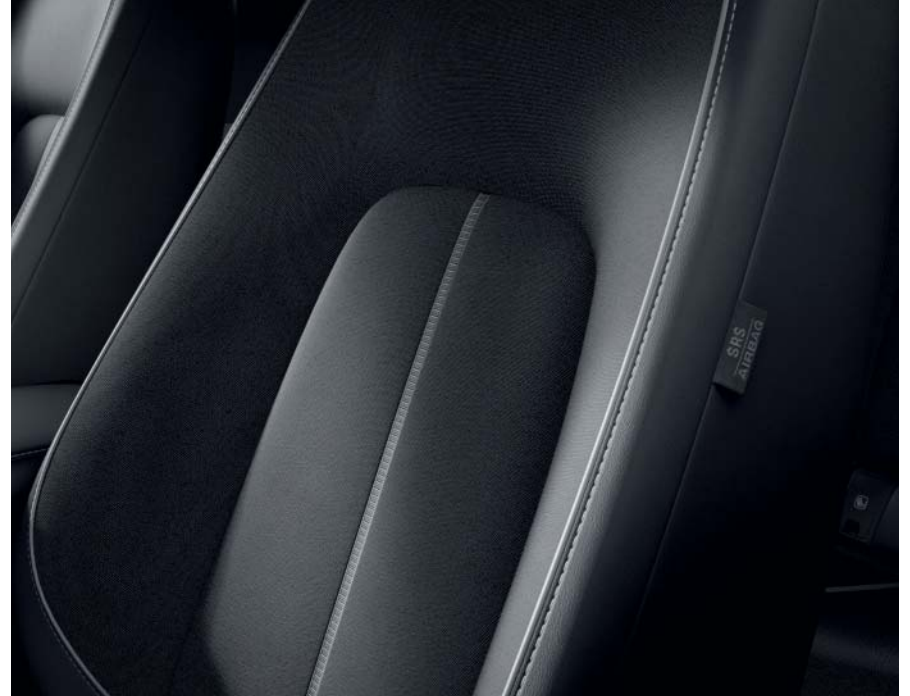
MAKOTO / Urban Expression