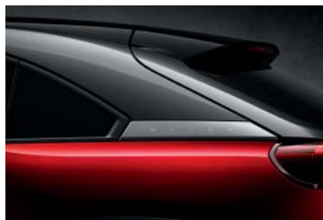
Soul Red Crystal (Multi-tone)