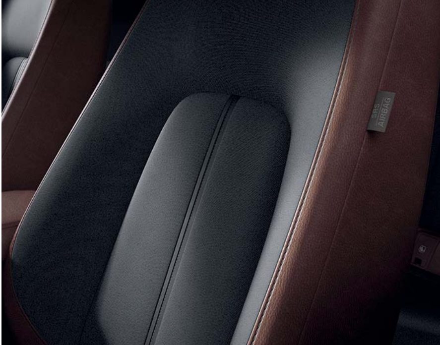
MAKOTO / Industrial Vintage