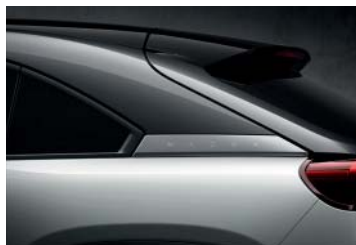
Ceramic White (Multi-tone)